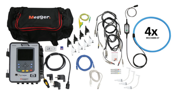
MPQ2000 Platinum Plus Kit C/N MPQ2000-P-KIT-PLUS

Includes MPQ2000 analyzer, voltage leads, SD card, USB cable, ethernet cable, universal power cords, soft-sided carry bag, plus fused adapters and 4 MCCV6000-37 (four range flex 37 cm ID) CTs