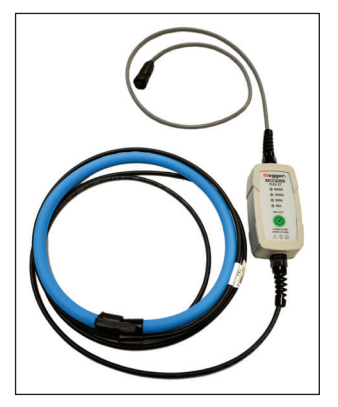
MCCV6000-18 MCCV6000-27 MCCV6000-37