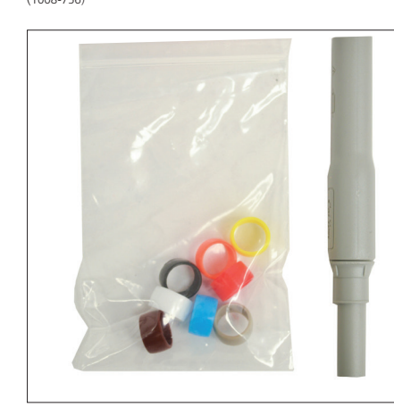
Optional Fuse Adapter Kit (1008-645)