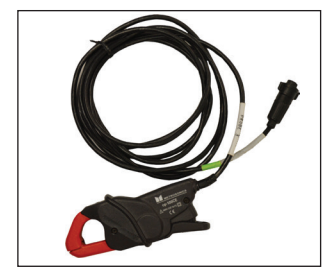
CP-5CE-ID, CP-20CE-ID, CP-100CE-ID

Fuses come with a kit of multi-color clip on bands. Configure the fuse adapters to match the color code of your voltage lead.