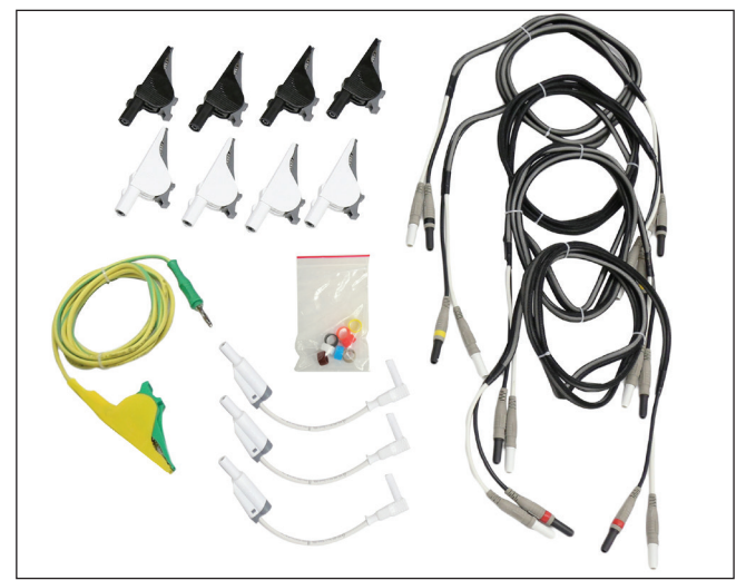
Voltage Lead Set (2007-216)